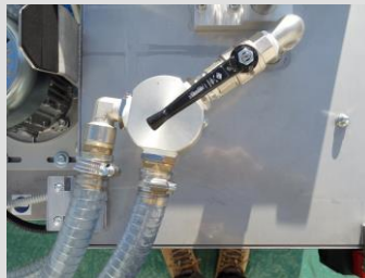
Double inlet dirty water