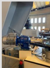
Mud cleaning unit