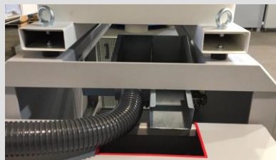
Clarified water exchanger