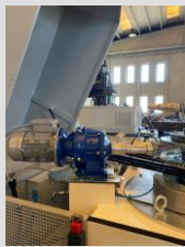
Mud cleaning group