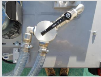
Double inlet dirty water